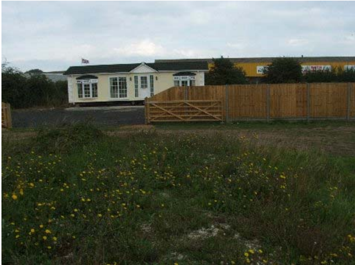
Plate 1: Private Site, Herne Bay (temporary planning permission)

East Kent Sub-Regional GTAA: Canterbury City Council, Dover District Council, Shepway District Council and Thanet District Council