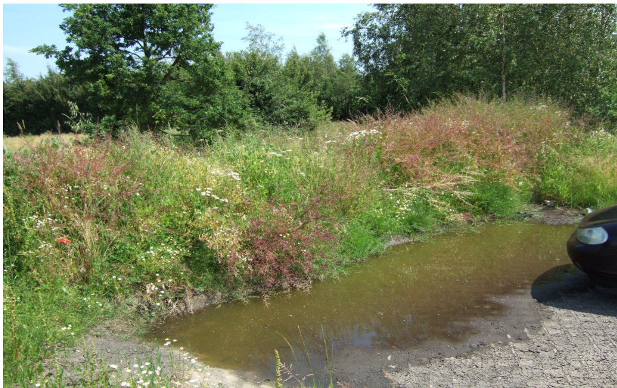
Plate 5: Location previously used for unauthorised encampments which has now been blocked off: piece of highway verge on the northern edge of the A257, East of Ash

guidance 26 for identification and referral of families. Where children and families are ‘slipping through the net’ of interagency working, valuable opportunities for support and appropriate intervention may be lost.