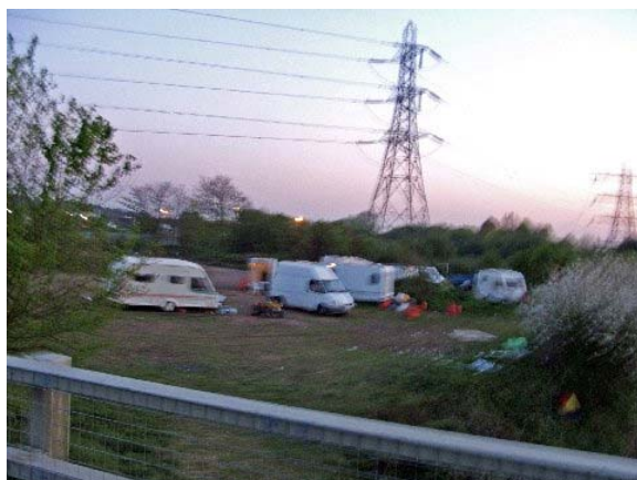
Plate 6: Unauthorised Encampment Opposite Greenbridge Site, Vauxhall Road, Canterbury