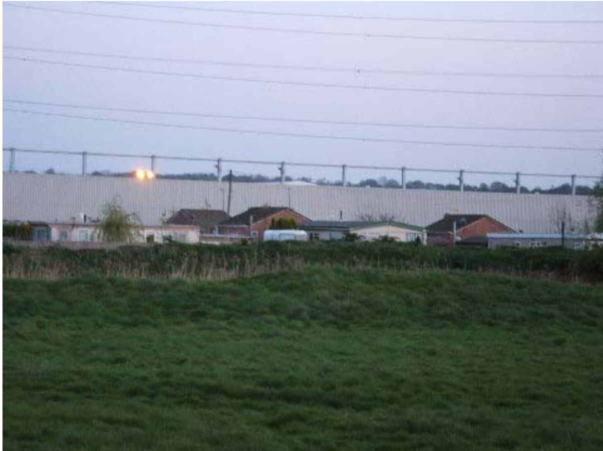
Plate 2: Local Authority Site, Vauxhall Road, Canterbury

East Kent Sub-Regional GTAA: Canterbury City Council, Dover District Council, Shepway District Council and Thanet District Council